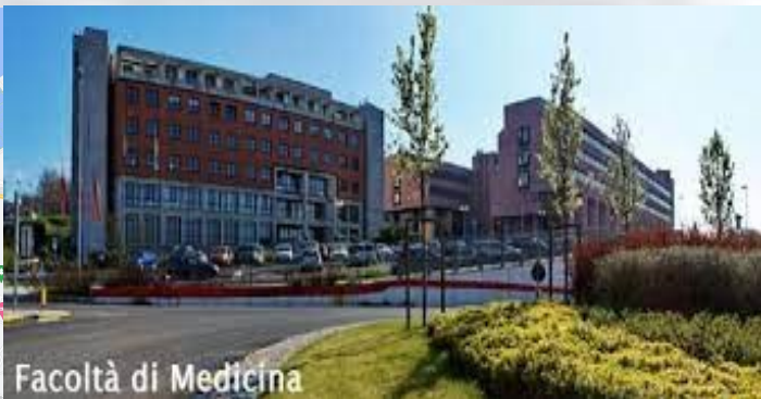
Facoltà di Medicina